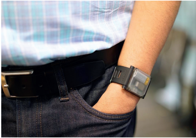
FIGURE 2 Example of a Wrist-Wearable Multiparametric Sensor

An early prototype of the Quanttus device measures multiple physiological parameters, including continuous beat-to-beat blood pressure. It is currently being evaluated in clinical studies.